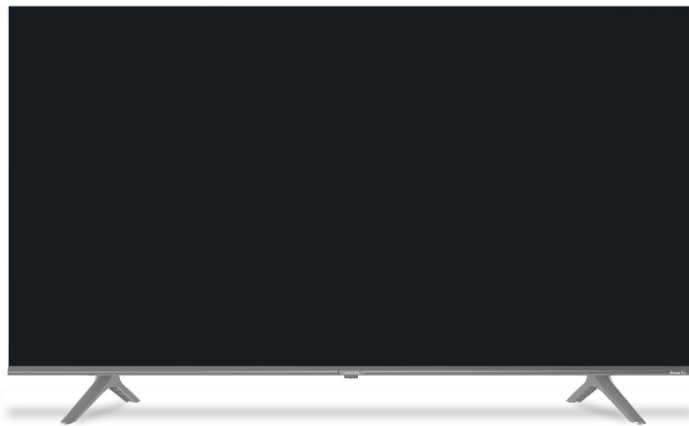
Roku TV 4k/UHD Smart TV