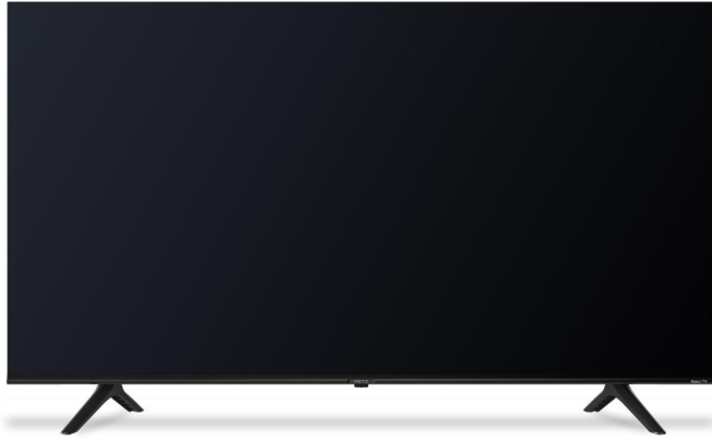
Roku TV 4k/UHD Smart TV