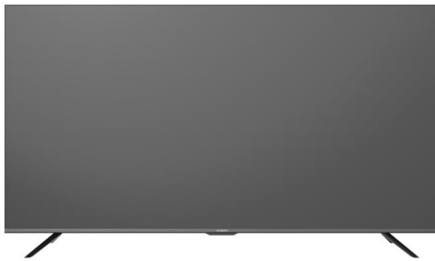
androidtv 4K/UHD Smart TV