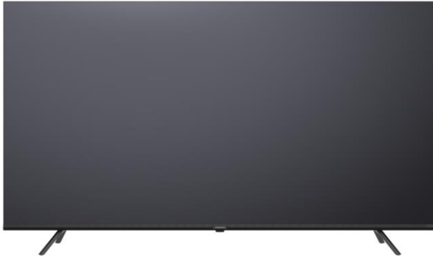
androidtv 4K/UHD Smart TV